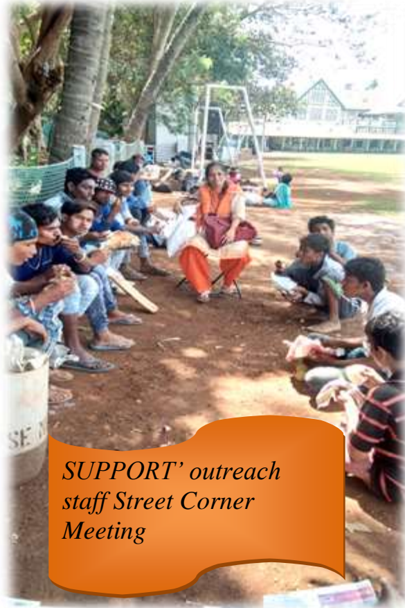
SUPPORT' outreach staff Street Corner Meeting