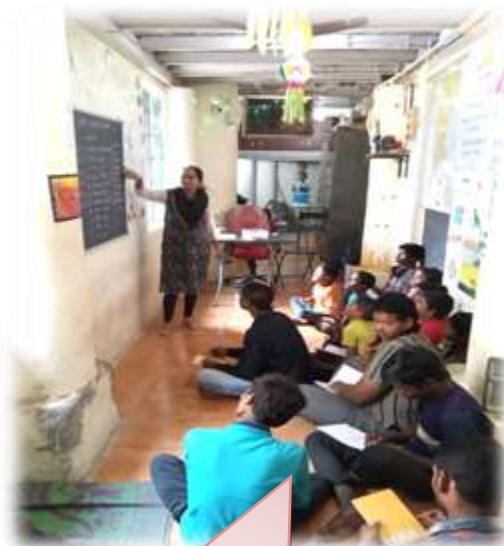
Non Formal education in progress..