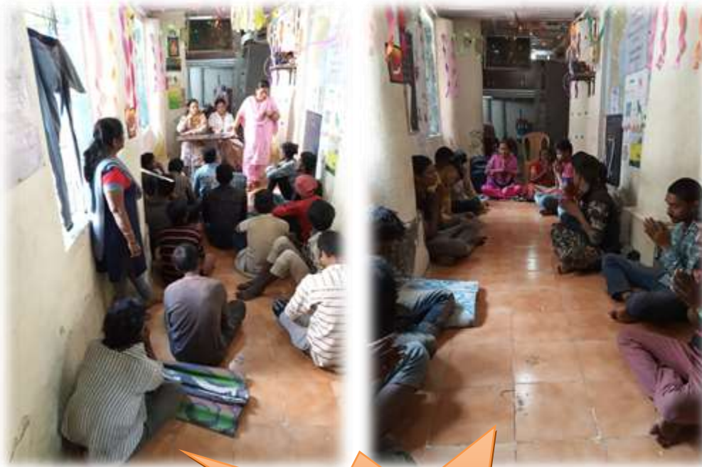
Group sessions in progress at the Day Care Center.