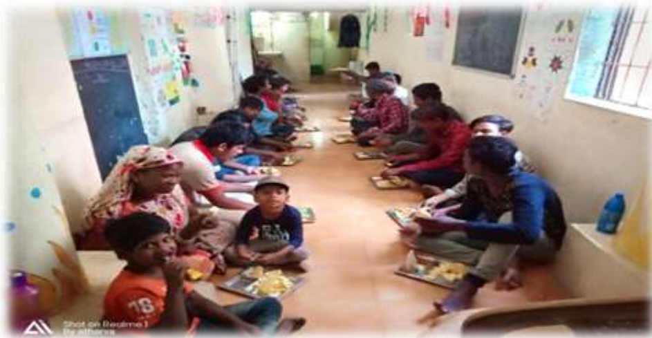
Meal time at the Center