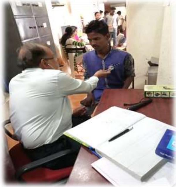
The Doctor examines the children and also checks their height and weight.