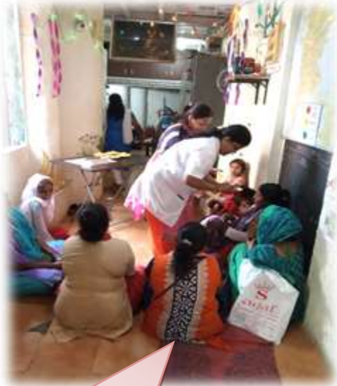
Haldi Cumcumprogramme with Street women. We create awareness among the women on drug addiction