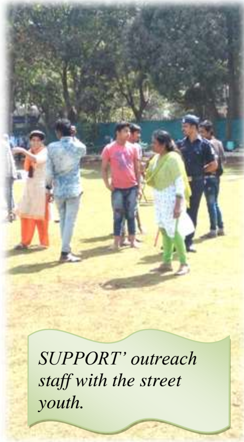
SUPPORT' outreach staff with the street youth.